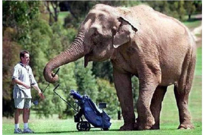
Who's your caddy?