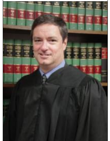
Judge Joe said meth is "wicked" and he opposes the legalization of drugs

the person visit the court weekly to discuss what they're doing to improve.