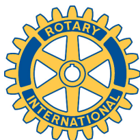
Will it build good will and better friendships?