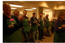
The Usual Suspects: East Wichita Rotarians at the Lord's Diner

our club. Steve is a Presbyterian minister and participated with 30 other churches in the "Love Wichita" campaign in which volunteers performed various public service activities to show their