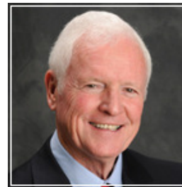
Medical students incur a debt of around $200,000

can make around $1 million a year, live in an exiting big city, and play golf on Wednesdays.