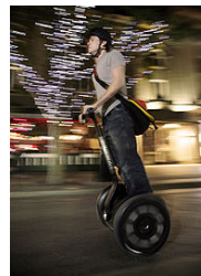
A Segway costs several thousand dollars or you can rent one for around $75 for 90 minutes.

a Segway, also known as a human transporter. We rode for about 90 minutes on sidewalks, streets, gravel roads, and grass. We covered around six miles