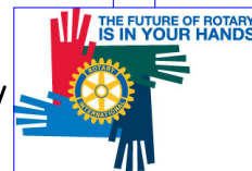
Is it the Truth?