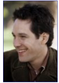
Actor Paul Rudd attended Shawnee Mission West High school and the University of Kansas

That's the premise of the comedy, Dinner for Schmucks , a combination comedy, love-story, and message movie starring Steve Carrell and Paul Rudd. By the way, I'm a Paul Rudd fan because a friend knows him and said that Paul's initial acting goal was to work as much as possible and not just seek the big payday. With that philosophy, Paul's now getting the big paydays.